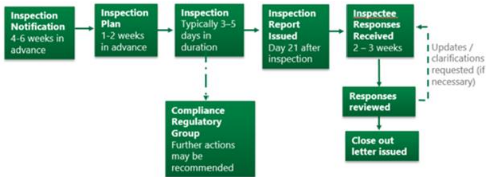
Figure 2: Routine national GCP inspection process