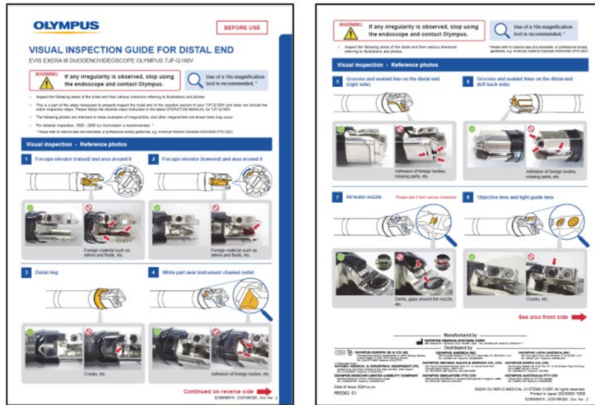
Figure 1: Visual Inspection Guide for distal end: Front side/Back side