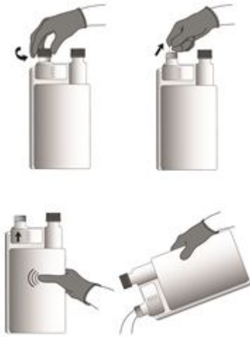
Figure 1 Use of the graduated chamber on the 1 litre containers:

To be used with an appropriate dosing system such as a dosing gun and coupling vented cap.