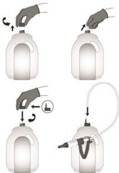
Figure 2 Attaching the recommended dosing gun to the 2.5 and 5 litre containers:

No signs of toxicity have been observed after administration of up to 5 times the recommended dose. No specific antidote has been identified.