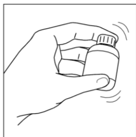
Figure 1: Administration of the veterinary medicinal product