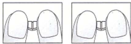
Diagrams 3 and 4: Easy breaking of half of the Nebivolol 5 mg cross-scored tablet into quarters.