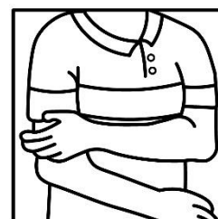
Gently massage to promote absorption.